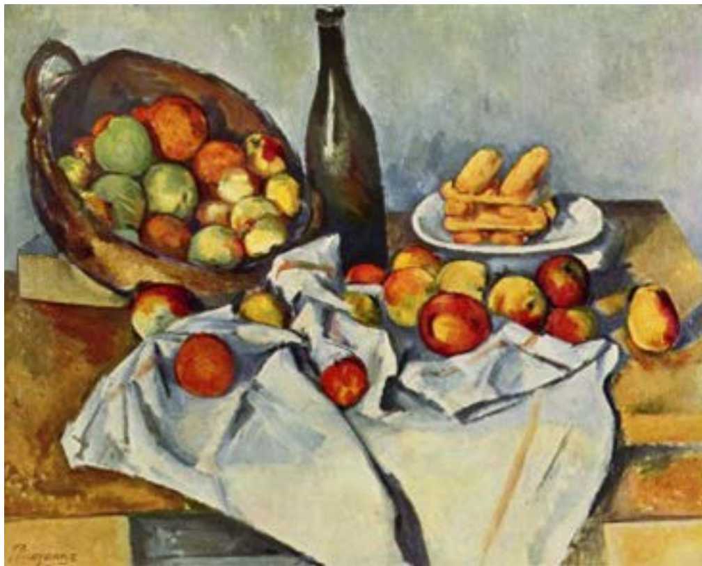
Figure 4. Image: Cézanne, Still Life with Basket of Apples (1890–94). Wikiart.org (public domain). Image description: In Cézanne's painting of apples above, the outlines between shapes are broken and imperfect, objects are stretched at the bottom, and the image collects at different angles instead of along a geometrical grid.

Cézanne's paintings draw us to recognize the unified and dynamic embodiment of experience. 9 Merleau-Ponty explains that the senses are not distinct from each other, especially touch and sight, unless we abstract from lived experience by introducing the concept of pure impressions or sensations (2012, 4). For Merleau-Ponty, the "perceptual