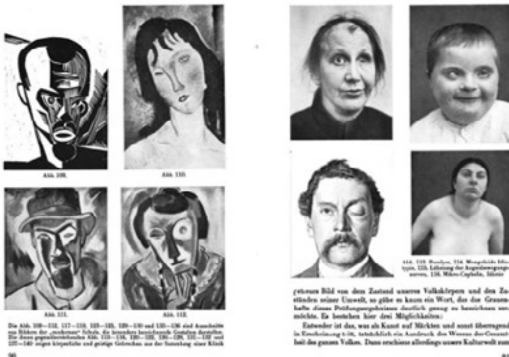
Figure 1. Images from Schultze-Naumburg’s (1928) Kunst und Rasse (Art and Race). Image description: Four portraits painted in expressive styles that characterize modern art movements like Fauvism and Cubism are compared with four photographs of people with visible disabilities.

The Degenerate Art exhibition made a similar judgment about modern artists in general—for example, declaring the artist Klee to be mad based on similarities between one of his portraits and a picture drawn by a schizophrenic patient. The content of the exhibit was based on Paul Schultze-Naumburg’s (1928) Kunst und Rasse (Art and Race), which argued that modern art movements like Fauvism and Cubism were corruptions of the artworld resulting from growing mental and physical deformities in Northern European races. These juxtapositions demonstrate the simplistic, pseudo-scientific rhetoric of the normate and the force of its desire to draw a hard line between ability and disability. The works of art were displayed not for admiration, but as a warning of the dangers of “the abnormal.” Viewers were to look at the similarities between the degenerate paintings and photographs of disabled people with disgust and fear (fig. 1).