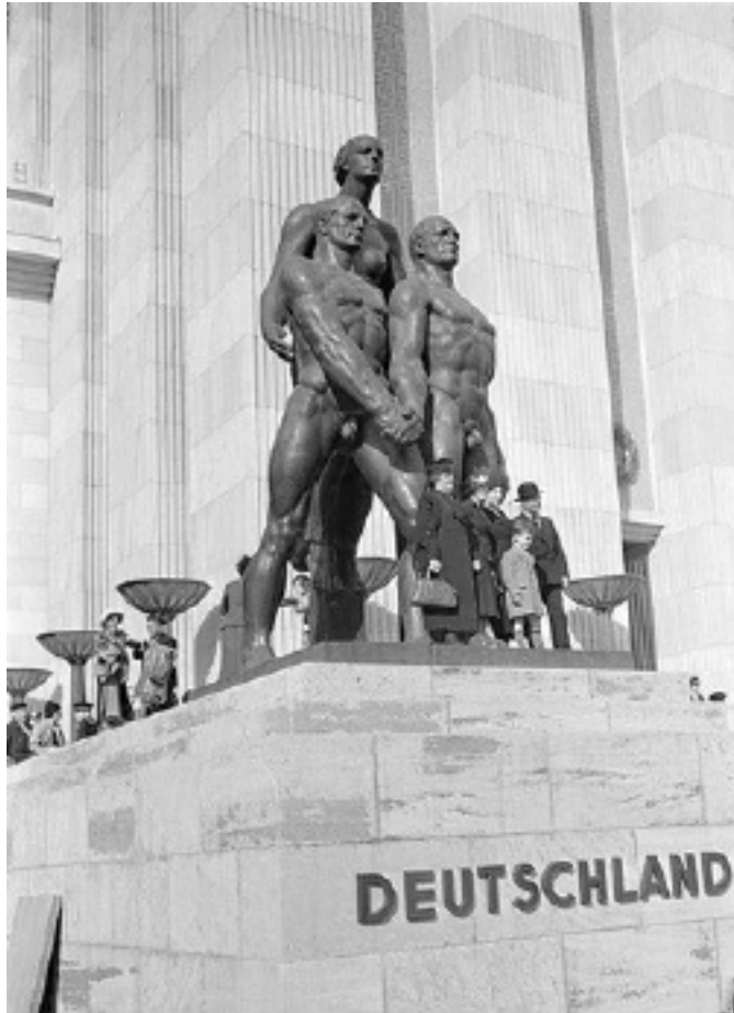
Figure 2. 1937 photograph of Josef Thorak's sculpture, The Family . Image description: Three nude figures, two male and one female, with exaggerated muscles and identical facial expressions stand rigidly on a pedestal that reads "Deutschland."

the rhetorical question, "would Nazi art be considered kitsch if it had not pursued so relentlessly a bombastic perfection of the body?" (5). The answer seems evident the more you examine the differences between the Degenerate Art exhibition and the Great German Art exhibition. Kitsch does not allow disability—or perhaps it makes sense to say that kitsch cannot portray disability because of a superficial and simplistic adherence to perfection. Kitsch art demonstrates the limitations of the normate.