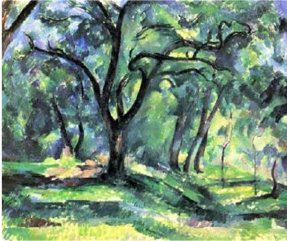
Figure 5. Paul Cézanne, Forest (1890). Image description: This painting of trees illustrates Cézanne’s technique of layering colorful lines in ways that convey their movement and evoke feeling.

“[r]ebounding among these, one’s glance captures a shape that emerges from among them all, just as it does in perception” (Merleau-Ponty 1964, 15). Cézanne use of color suggests the object as it emerges in experience, rather than a discrete object of pure presence. For this reason, Merleau-Ponty describes Cézanne as capturing “the vibration of appearances which is the cradle of things” (1964, 18). These techniques explain why Cézanne’s paintings of trees are so full of life.